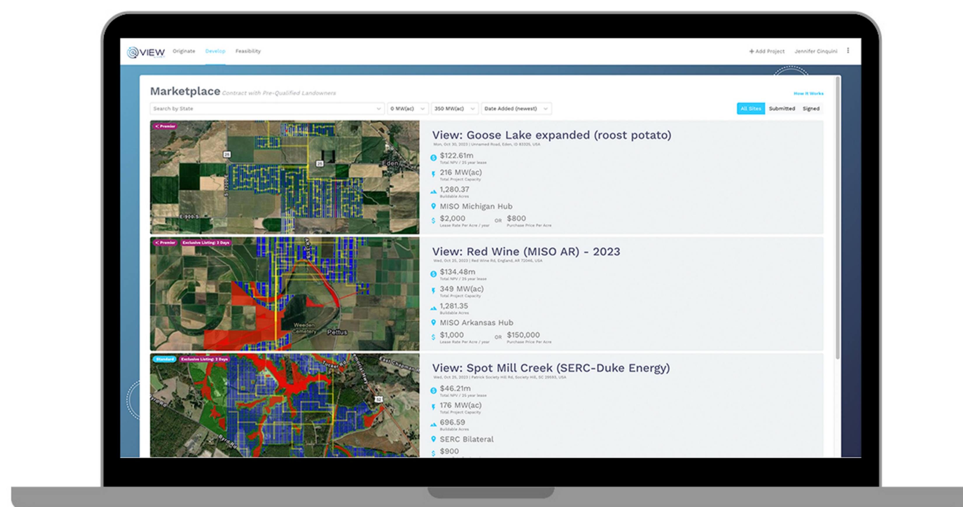
Mockup for demonstration only. Subject to change.