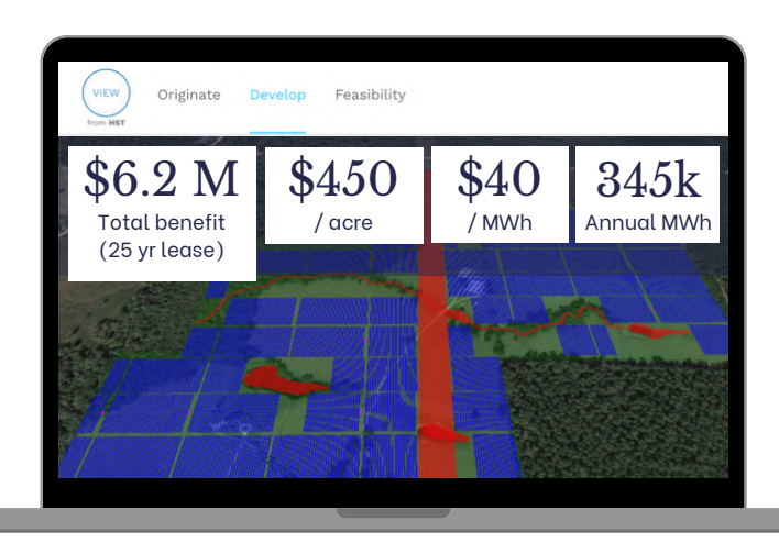
Mockup for demonstration only. Subject to change.